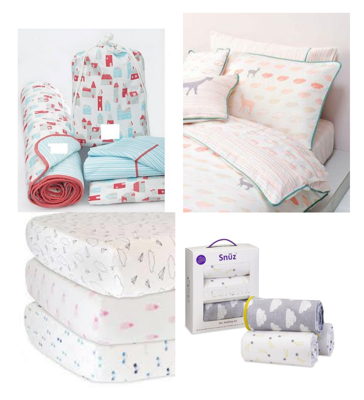
Jersey & Woven Crib Sheets with Box Packaging